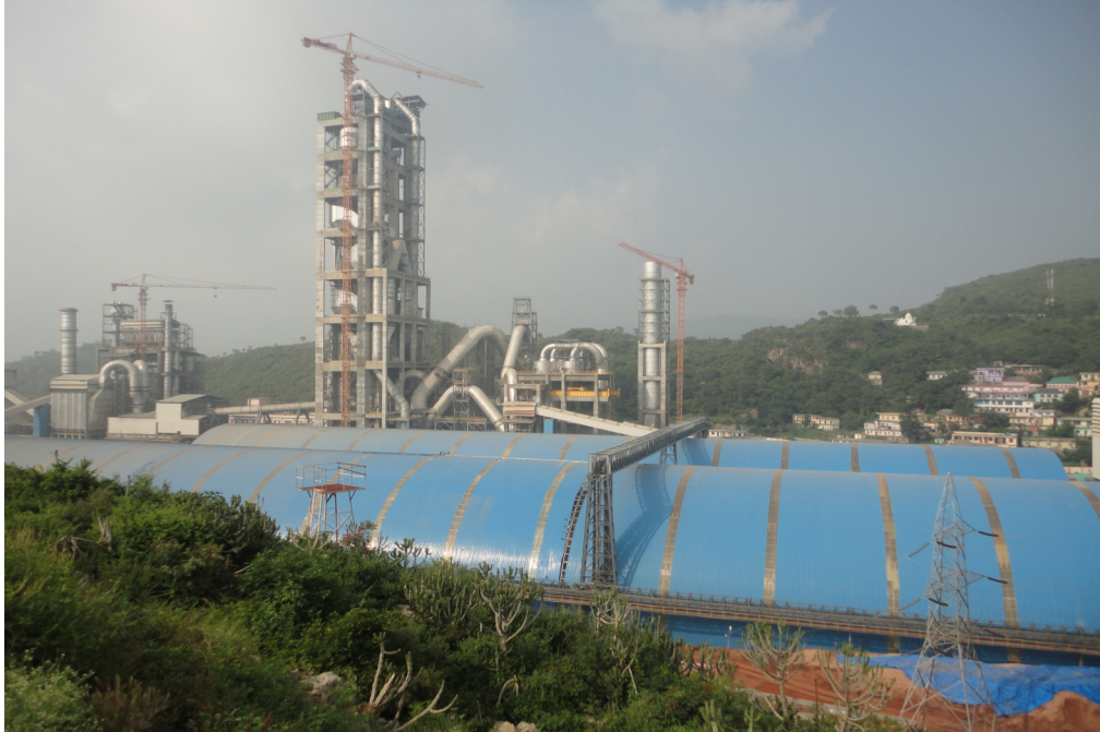
AMBUJA CEMENTS LIMITED. UNIT RAURI (H.P.)