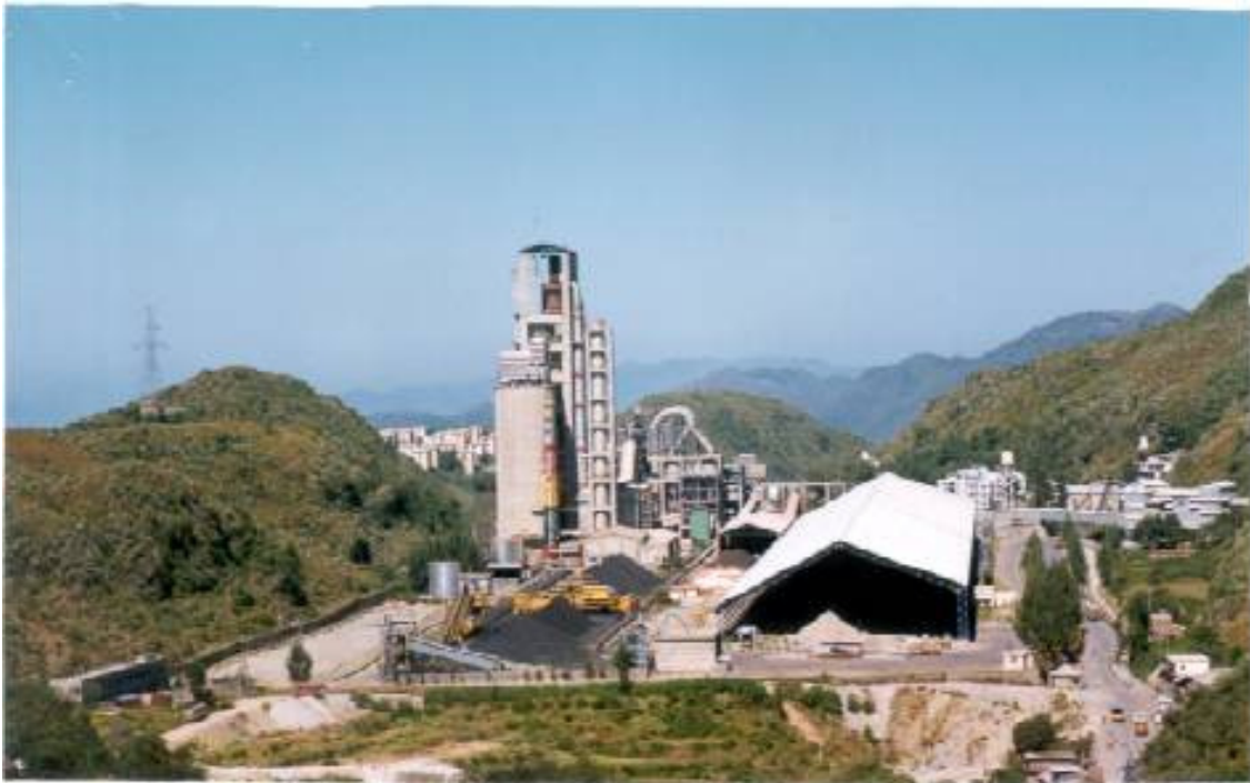
AMBUJA CEMENTS LTD. UNIT SULGI (H.P.)