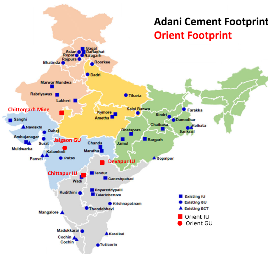
Orient Cement's Plant wise Capacity