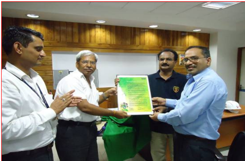
SUSTAINABLE DEVELOPMENT (OUR CORPORATE PHILOSOPHY)