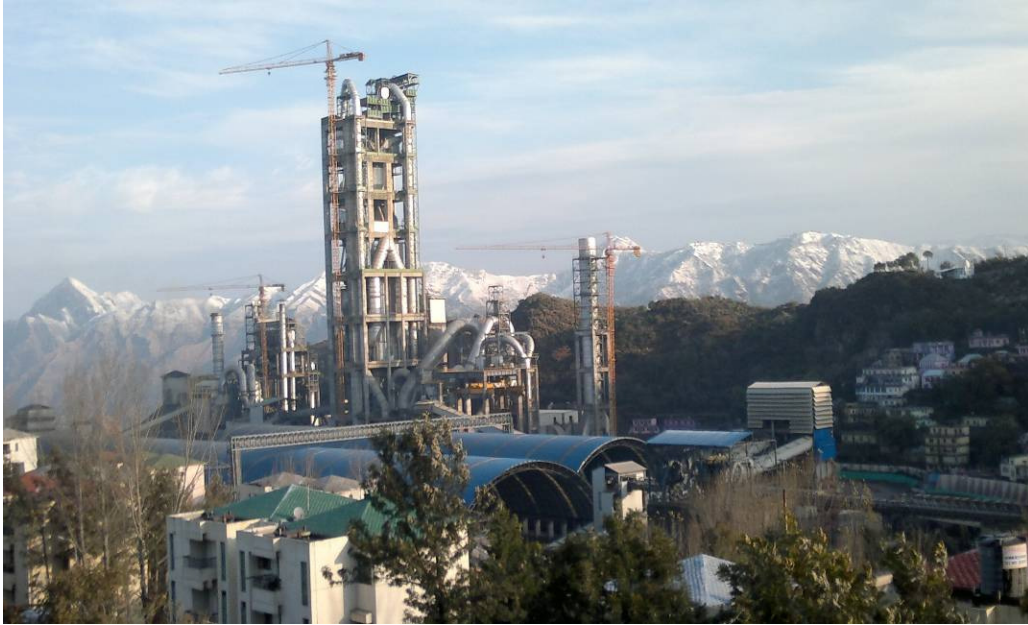
AMBUJA CEMENTS LIMITED. UNIT RAURI (H.P.)