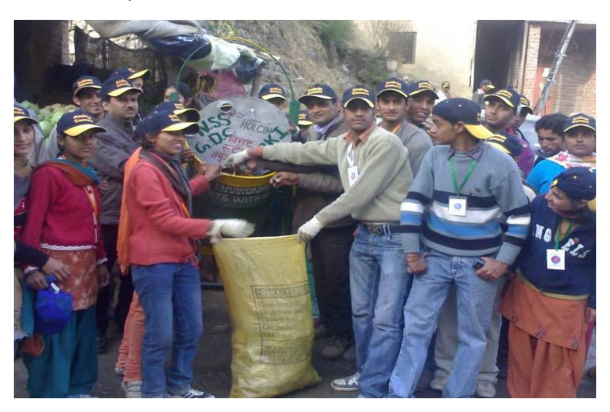
CLEAN ENVIRONMENT STARTS WITH ME