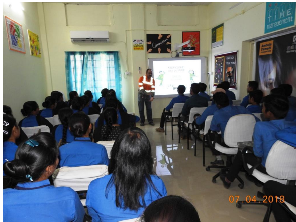
Soft Skill Training at SEDI Fire safety Training