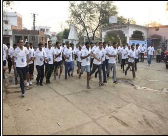
Installation of Solar Pump for Irrigation Run for Water Campaign