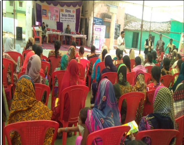
Awareness Campaign on HIV AIDS& Cancer