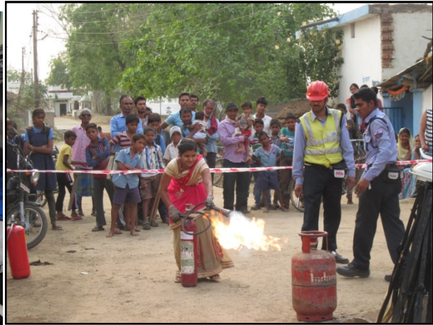
Safety Community Engagement: