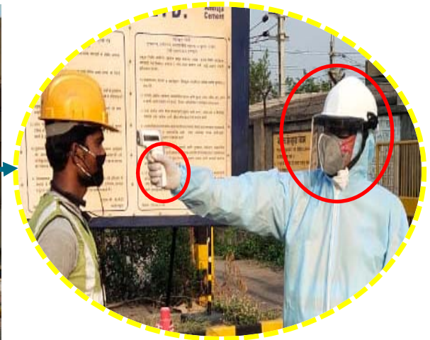
Security person while Screening